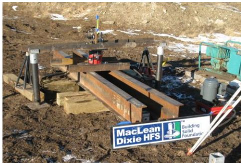
Full scale field testing- compression/tension/lateral

MacLean-Dixie Helical Piles and Anchors undergoing rigorous testing at an IAS accredited lab to ICC AC358 Acceptance Criteria For Helical Foundation Systems and Device. Ongoing quality control program per AC10 with inspections by an IAS accredited inspection agency per AC98