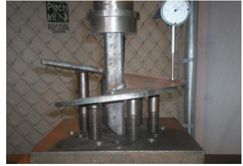
Helix Strength Test