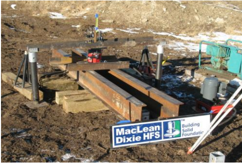
Full scale field testing-compression/tension/lateral

MacLean-Dixie Helical Piles and Anchors underwent rigorous testing at an IAS accredited lab to ICC AC358 Acceptance Criteria For Helical Foundation Systems and Devices. Ongoing quality control program per AC10 with inspections by an IAS accredited inspection agency per AC98