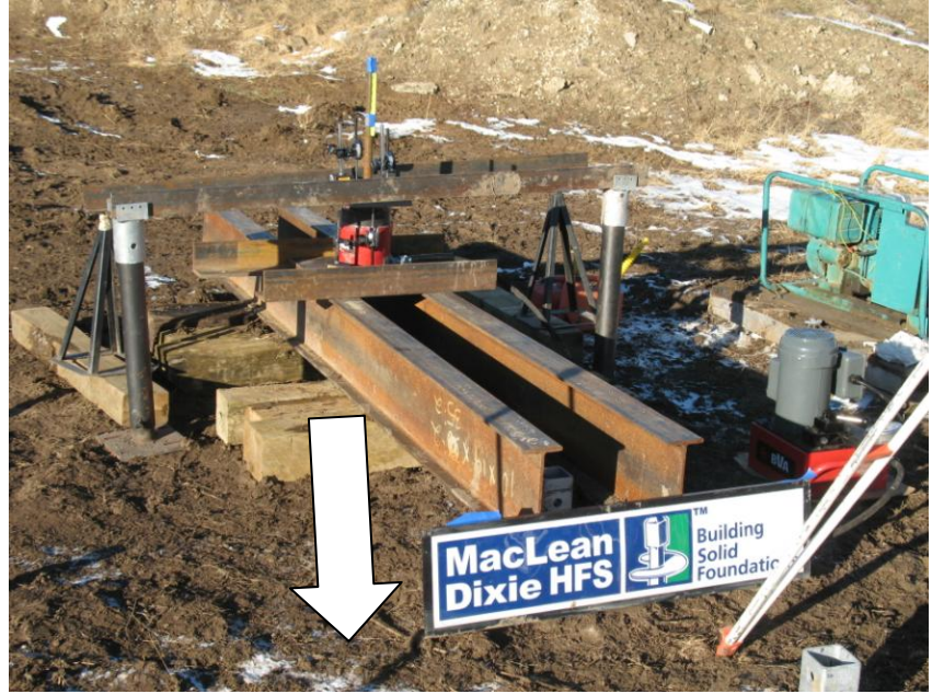
Pounds-force using a hydraulic cylinder to test pile in compression