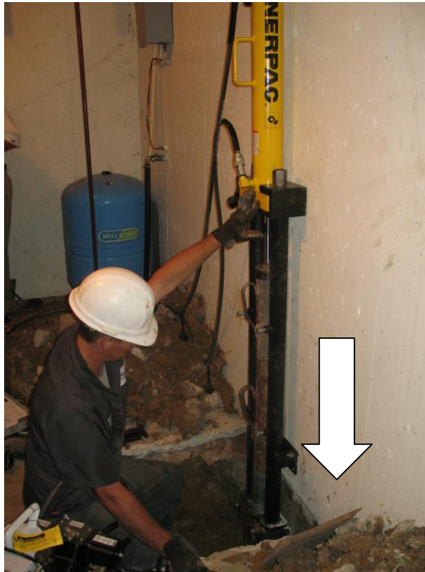
Pounds-force driving a resistance pile