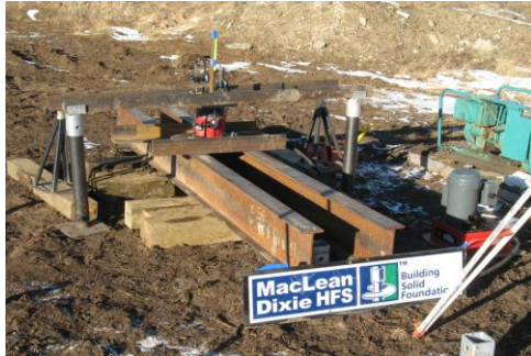
Full scale field testing- compression/tension/lateral

MacLean-Dixie Helical Piles and Anchors underwent rigorous testing at an IAS accredited lab to ICC AC358 Acceptance Criteria For Helical Foundation Systems and Device. Ongoing quality control program per AC10 with inspections by an IAS accredited inspection agency per AC98