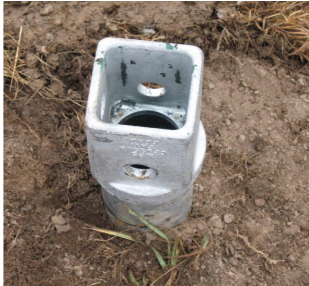
Pipe pile and coupling system remains undamaged during installation

Conventional Pipe Piles - Elongated/torn holes with round pipe pile coupling & bolts in shear.