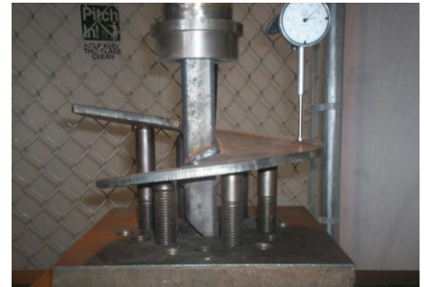
Helix Strength Test