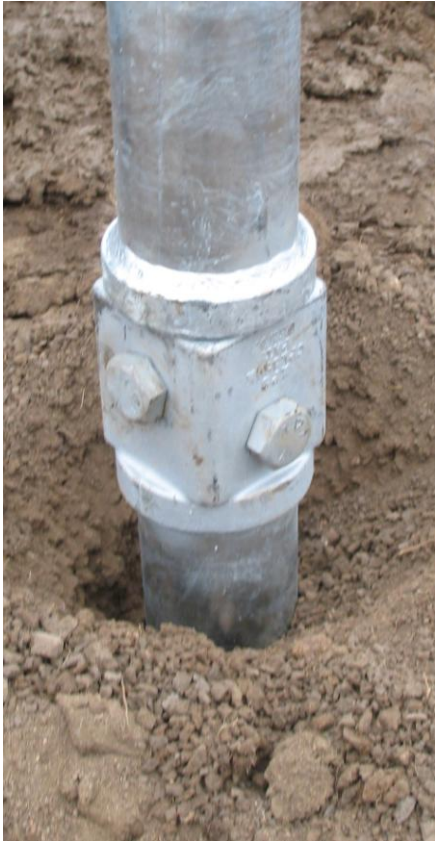
2-bolt Cross Connection

MacLean-Dixie "Strength Squared™" coupling system (Patent pending)