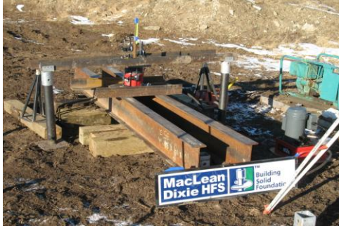
Full scale field testing- compression/tension/lateral

MacLean-Dixie Helical Piles and Anchors undergoing rigorous testing at an IAS accredited lab to ICC AC358 Acceptance Criteria For Helical Foundation Systems and Device. Ongoing quality control program per AC10 with inspections by an IAS accredited inspection agency per AC98